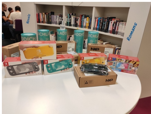
Figure 1: Winner prizes in 2019